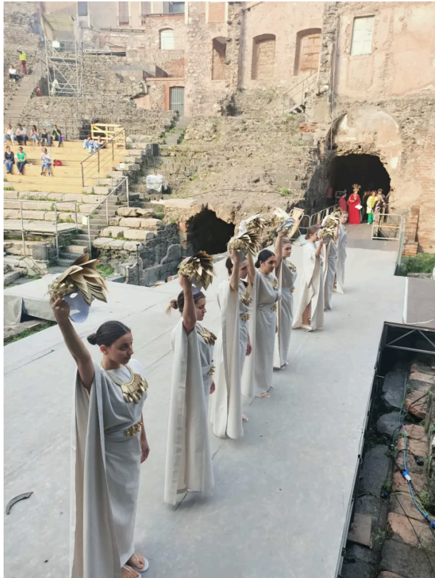
Catania, Italy (Sicily)