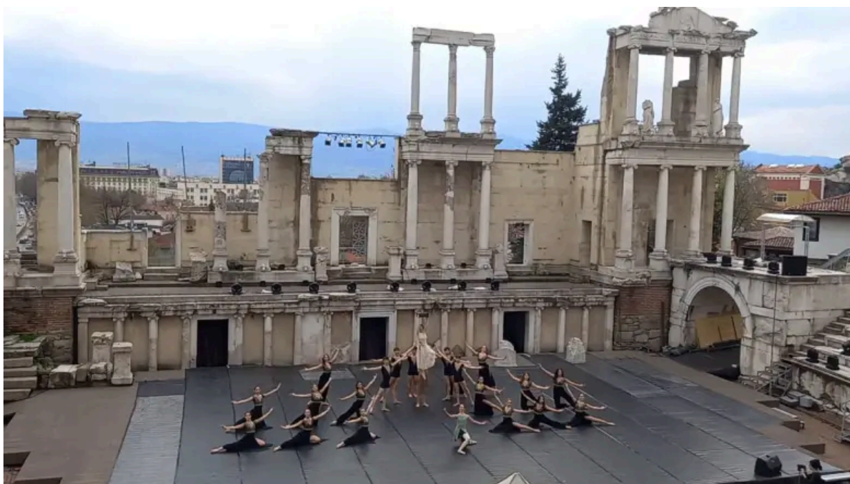
Plovdiv, Thracian (Bulgaria)