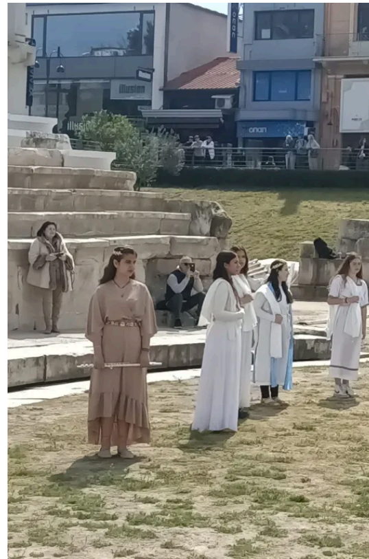
Larissa, Thessaly (Greece)