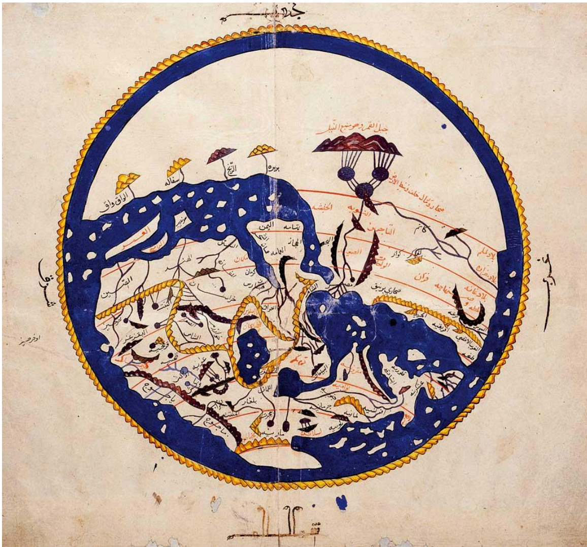
Map of the known world drawn up by the Arab geographer and scholar Al Idrisi.